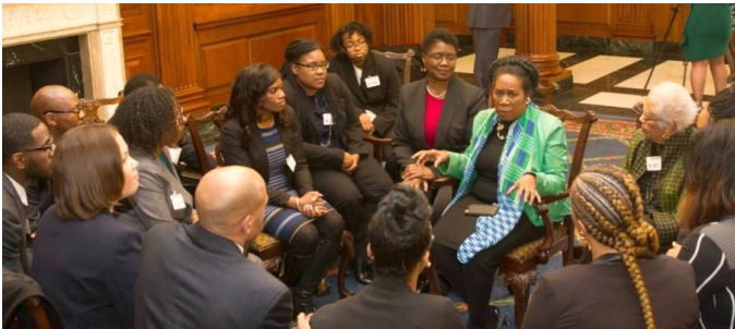
Congresswoman Sheila Jackson Lee, D-TX ( seated center ) sharing legislative priorities with MSDL Class IX and Faculty Team.