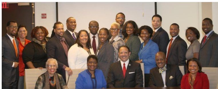
MSDL VI Class and Faculty with guest lecturer, Mr. Marc Morial, President, National Urban League (seated center).

MASTERS SERIES FOR DISTINGUISHED LEADERS (MSDL) was founded in 2008 by the African American Leadership Family , a cadre of accomplished veteran leaders, committed to nurturing and developing a new generation of difference making executive leaders. MSDL is a culturally sensitive, global leadership excellence and community service program for people of color in middle management, ages 25-45. It assists high performing business, government, and nonprofit leaders to impact their organizations, communities, and the underserved. MSDL has graduated nearly 144 gifted and talented executives since 2008.